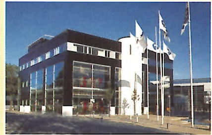
Main conference buildings: Top: "Visionen". Bottom: "The Library"

Registration: Registration will take place in the lobby at First Hotel Mårtensson on Sunday 13/6, between 16.00 and 21.00, and at Halmstad University on Monday 14/6 between 09.00 - 13.30.