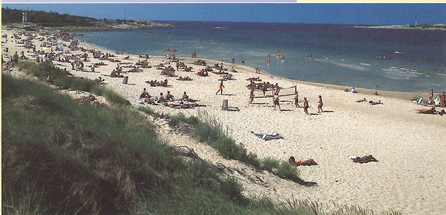
The beach at Tylösand, 8 km from the central of Halmstad